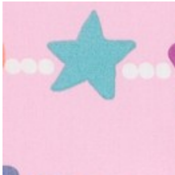
05534.003 LIGHT PINK