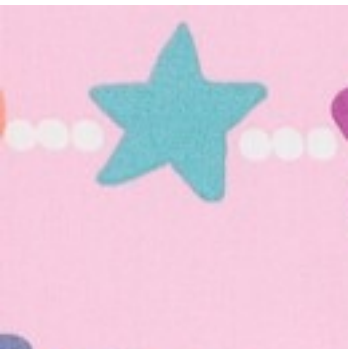
05534.003 LIGHT PINK