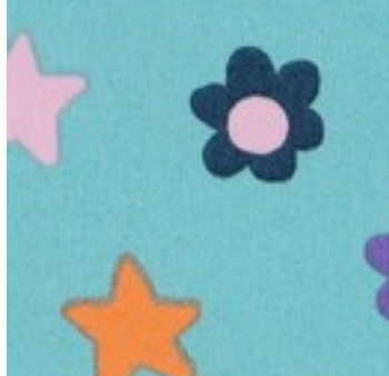
05534.014 LIGHT PETROL