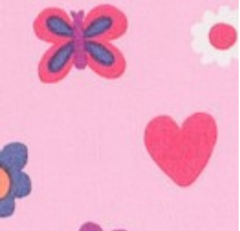
05534.013 LIGHT PINK