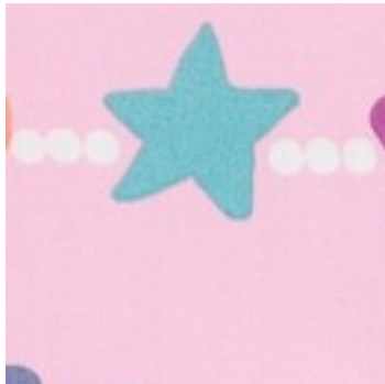
05534.003 LIGHT PINK