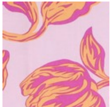
05495.001 LIGHT PINK