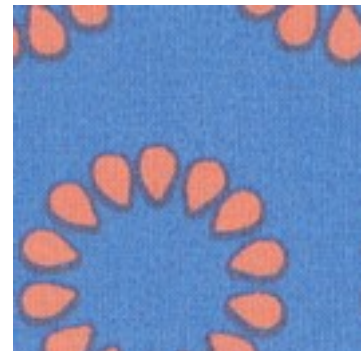
C5467.004 LIGHT BLUE