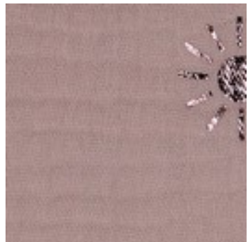
03642.015 SOFT ROSE