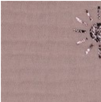
03642.015 SOFT ROSE