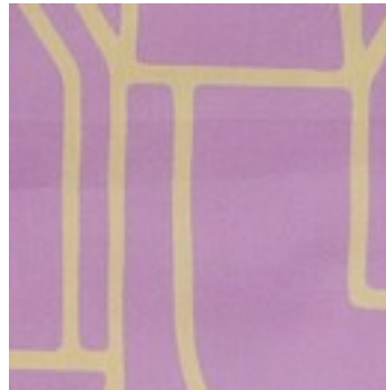
05455.023 SOFT LAVENDER