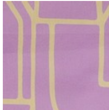
05455.023 SOFT LAVENDER