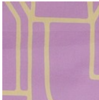
05455.023 SOFT LAVENDER