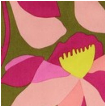
05450.002 MOSS GREEN