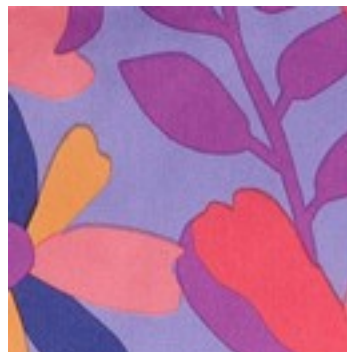
05450.023 SKY BLUE