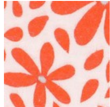
05529.010 LIGHT PINK