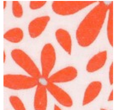
05529.010 LIGHT PINK