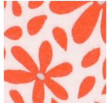
05529.010 LIGHT PINK