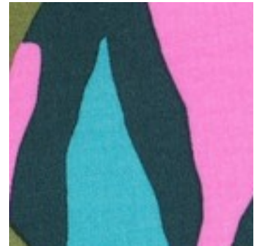
05373.004 DARK GREEN