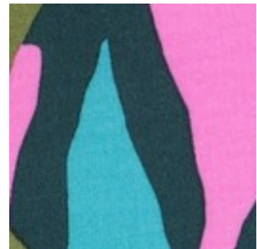
05373.004 DARK GREEN