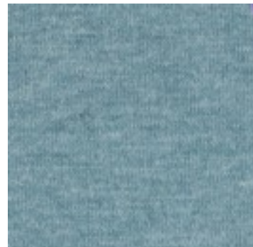
05114.032 SMOKE BLUE