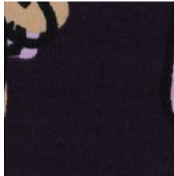
05097.005 DARK PURPLE