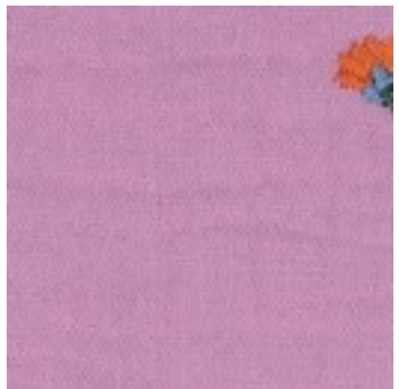
03650.065 LIGHT PINK