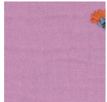
03650.065 LIGHT PINK