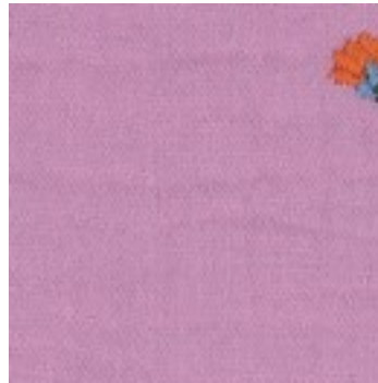
03650.065 LIGHT PINK