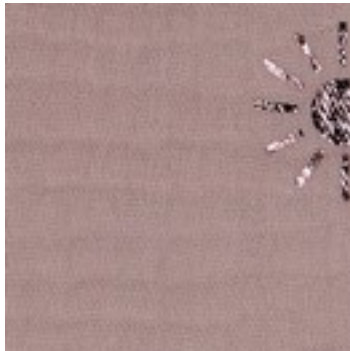
03642.015 SOFT ROSE