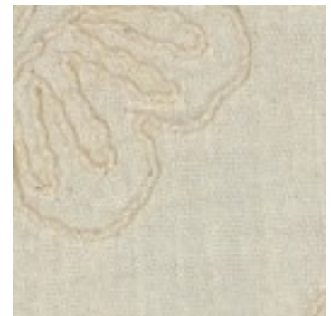
03649.062 NATURAL WASHED