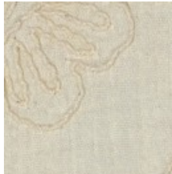
03649.062 NATURAL WASHED