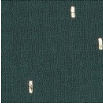
07261.015 DARK GREEN/GOLD