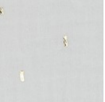
07261.006 OFF WHITE/GOLD