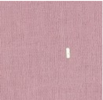
07261.008 OLD ROSE/GOLD