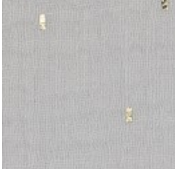
07261.007 LIGHT GREY/GOLD