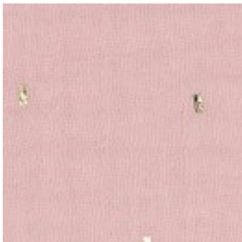
07261.003 LIGHT ROSE/GOLD