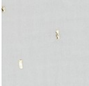
07261.006 OFF WHITE/GOLD