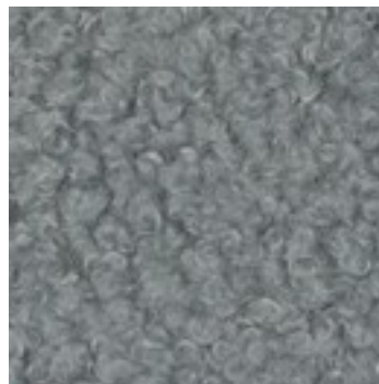
03443.005 PALE TURQUISE