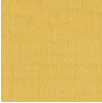
09959.026 SOFT YELLOW