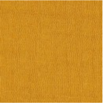
09959.023 DARK YELLOW