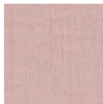
09959.015 SOFT ROSE