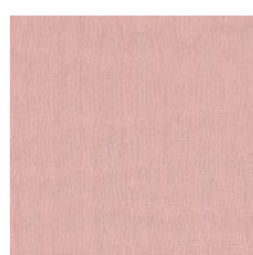
09959.021 LIGHT ROSE