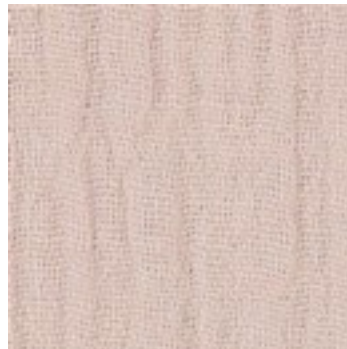
03959.015 SOFT ROSE