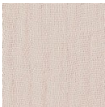
03959.021 LIGHT ROSE