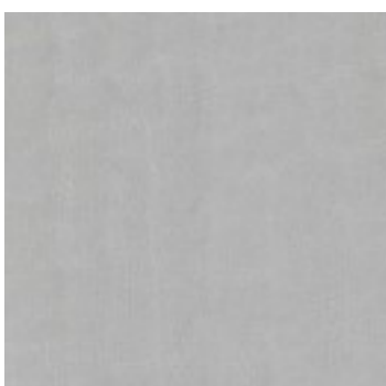
03959.022 LIGHT GREY