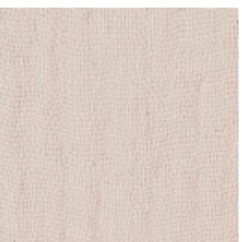
03959.021 LIGHT ROSE