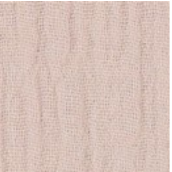
03959.015 SOFT ROSE