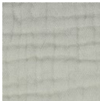
03959.045 LIGHT SAND