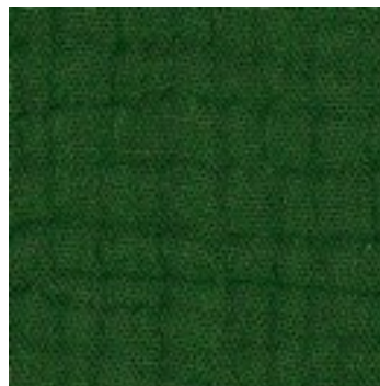
03959.042 DARK GREEN