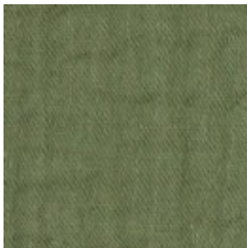
03959.041 MOSS GREEN