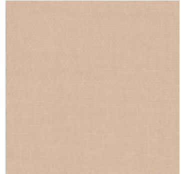
03959.025 LIGHT SALMON