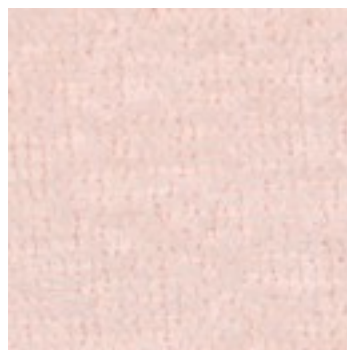
01882.039 LIGHT ROSE