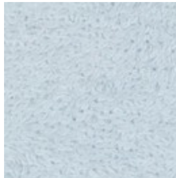
01882.005 LIGHT BLUE