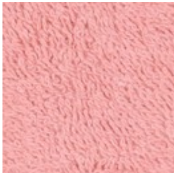
01882.053 OLD ROSE