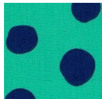
04310.026 NAVY/ PETROL