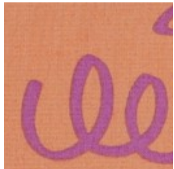
04310.003 PEACH/ PURPLE