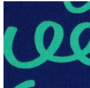
04310.006 NAVY/ PETROL