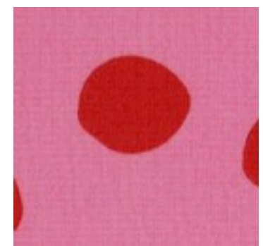
04310.028 RED/ PINK