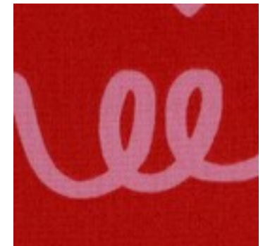
04310.008 RED/ PINK