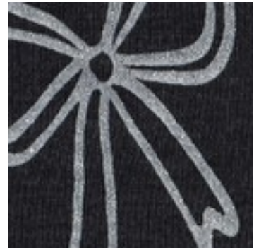
04121.005 INDIGO MELANGE