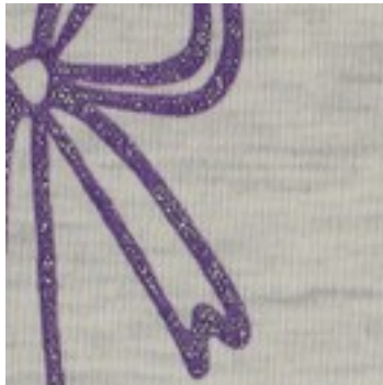
04121.001 ECRU MELANGE