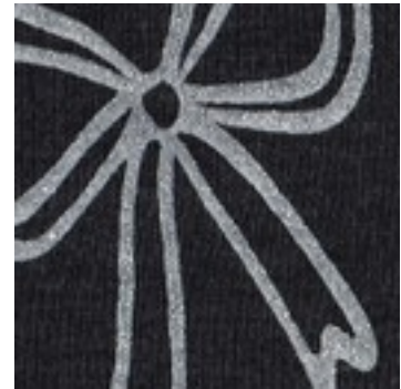
04121.005 INDIGO MELANGE