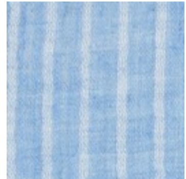
03566.003 LIGHT BLUE