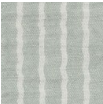
03566.004 OLD GREEN