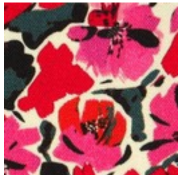
04218.004 LIGHT PINK / PETROL