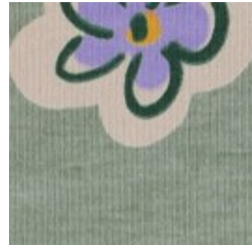
04134.017 DARK MINT MELANGE