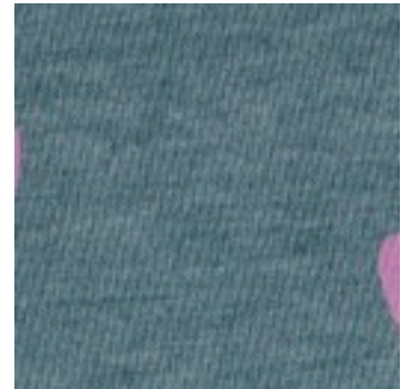
04118.032 SMOKE BLUE MELANGE