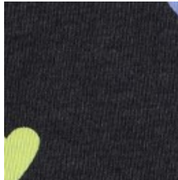
04118.005 INDIGO MELANGE