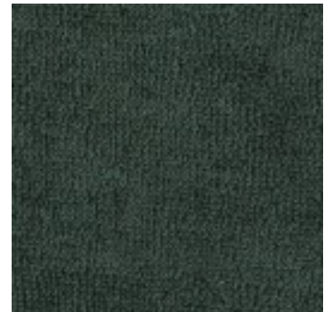
02551.027 DARK GREEN