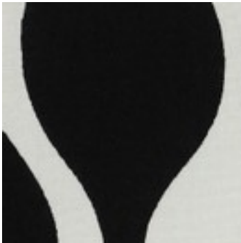
04250.001 BLACK / ECRU