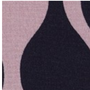
04250.003 NAVY / MAUVE