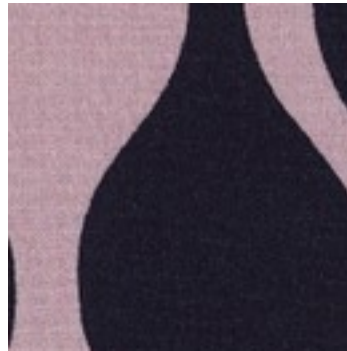
04250.003 NAVY / MAUVE