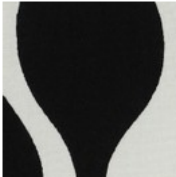
04250.001 BLACK / ECRU