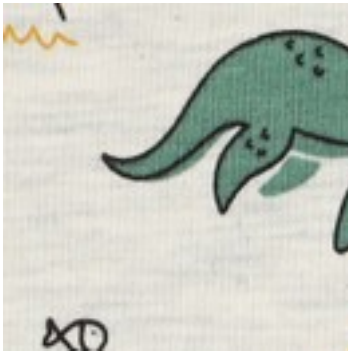
04133.001 ECRU MELANGE