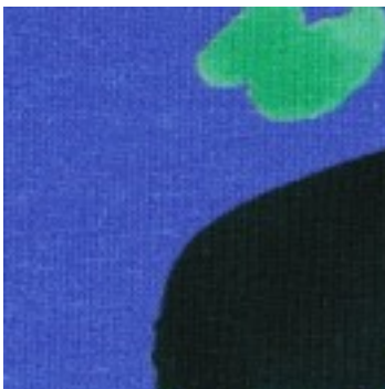
04047.013 LIGHT BLUE