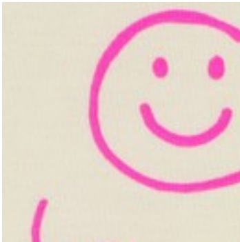
04117.001 OFF WHITE