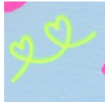
04117.002 LIGHT BLUE