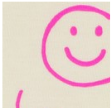
04117.001 OFF WHITE