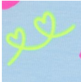
04117.002 LIGHT BLUE