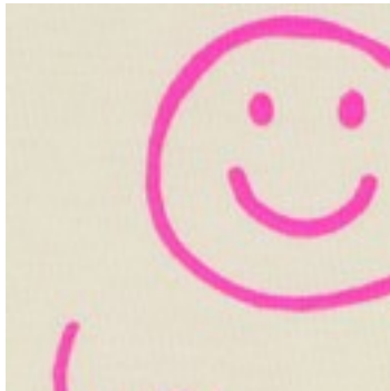
04117.001 OFF WHITE